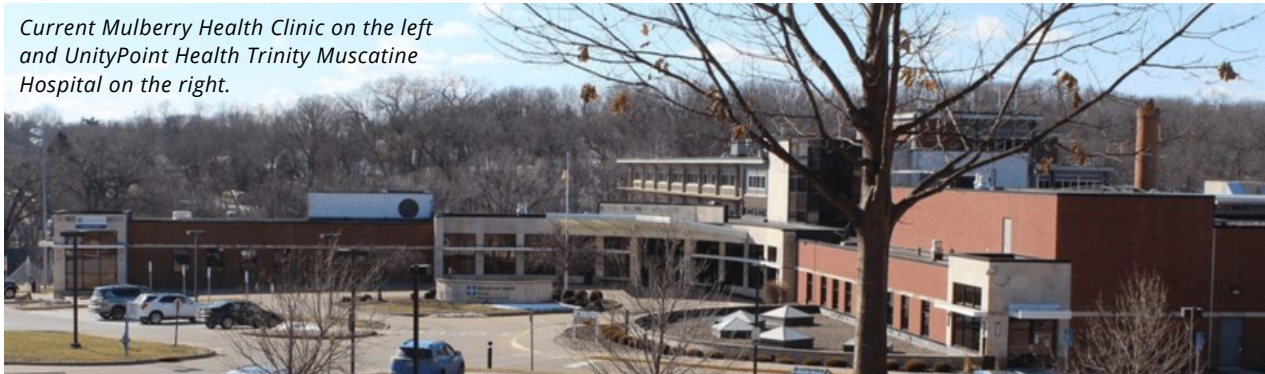
Current Mulberry Health Clinic on the left and UnityPoint Health Trinity Muscatine Hospital on the right.

The one-time funding injection for this project will propel decreased healthcare system costs and improved health outcomes for the residents of Muscatine County, far into the future.