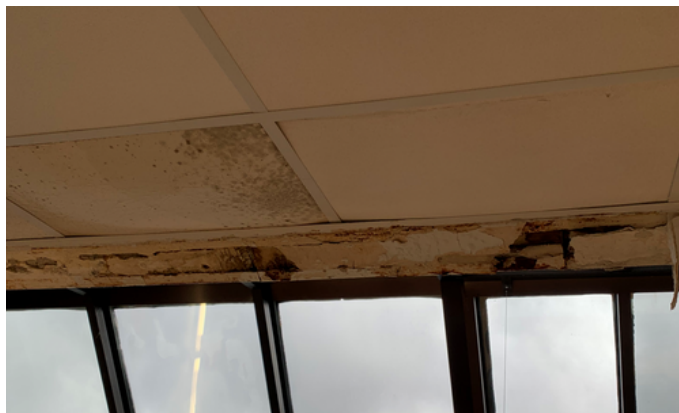
Photos of Mulberry Health Clinic with water leaking from the ceiling.