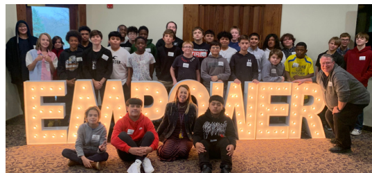
Empowered local students and community leaders