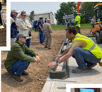
Pioneered 3D home printing in Muscatine