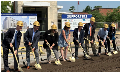
Broke ground on the new Mulberry Health Clinic