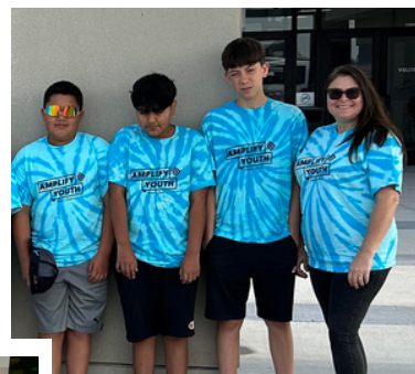
Launched ‘Amplify Youth’ in West Liberty

Our donors and partners give meaningfully and generously to make this work possible.